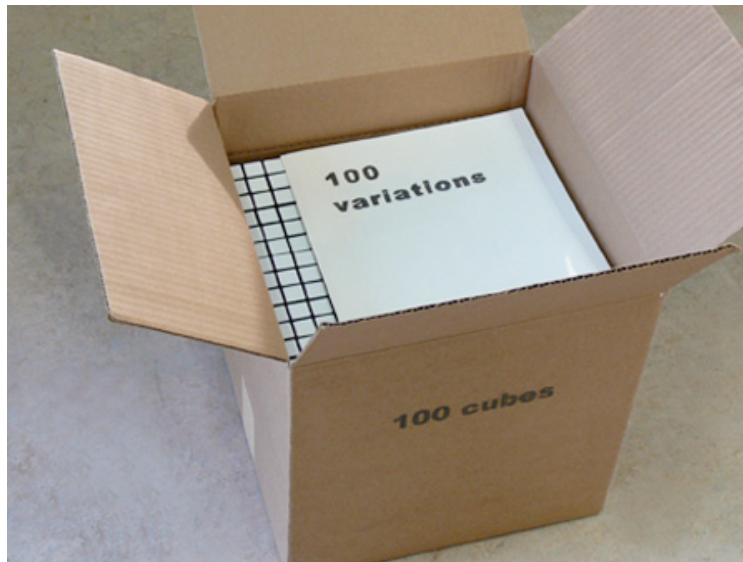
Roula Partheniou Possible Forms, (100 Cubes, instructions for 100 Variations) 2008

Partheniou's reformulated cubes are central to her larger project. After grey-scaling the blocks, she added new rules to the game. Engaging the sculptural and architectural qualities of her material, she set parameters for stacking and combining the units and laid out plans for stacked formations using simple mathematical calculations on paper. She then followed her renderings to create 100 variations of 100 stacked grey-scale Rubik's cubes. The resulting structures have an architectural quality. Optical illusions are at play as you move your eyes over the sculptures. It is a disorienting sensation because the light and shadow of the sculptures often does not correspond to the light in the gallery.