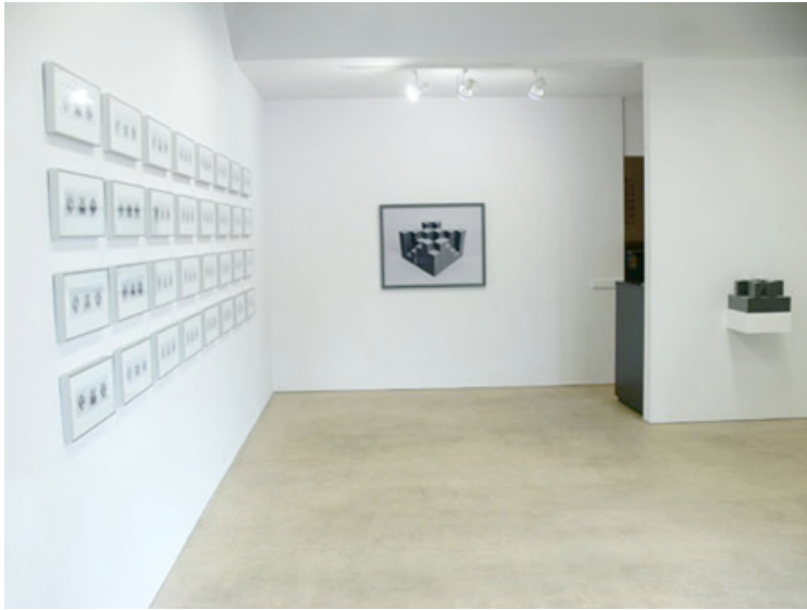
Roula Partheniou "100 Variations" 2008 Installation view

Subscribe to Canadian Art today and save 30% off the newstand price.